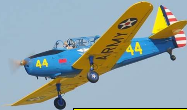
WI Wing PT-26 N9474H