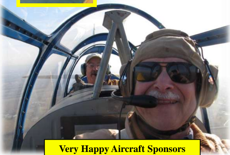
Very Happy Aircraft Sponsors