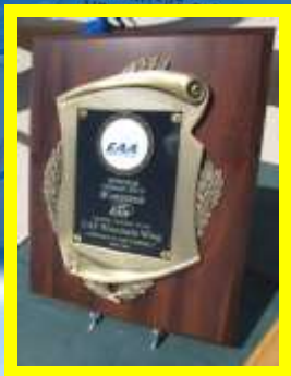
"Judge's Choice" AirVenture 2013