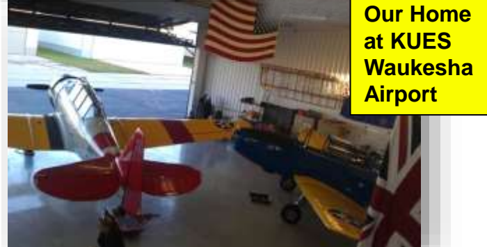
Our Home at KUES Waukesha Airport