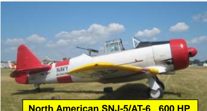
North American SNJ-5/AT-6 600 HP